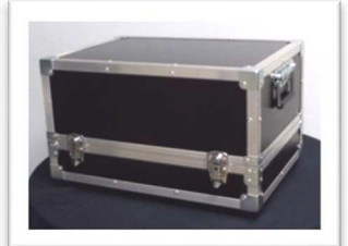
Suitcase for post planning and transportation (OPxxxx) large : 355 x 505 x 310 mm - weight empty : 13 kg + (OPxxxx) small : 290 x 250 x 310 mm - weight empty : 5 kg